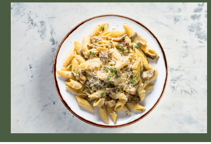
Recommended for lunch or dinner